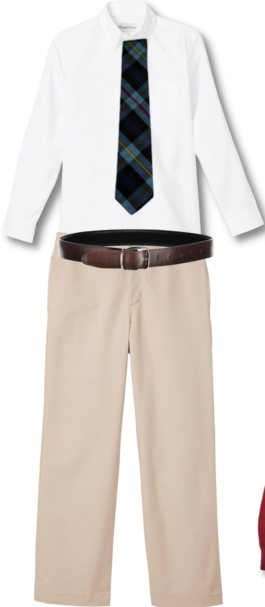
Permitted until June 2025