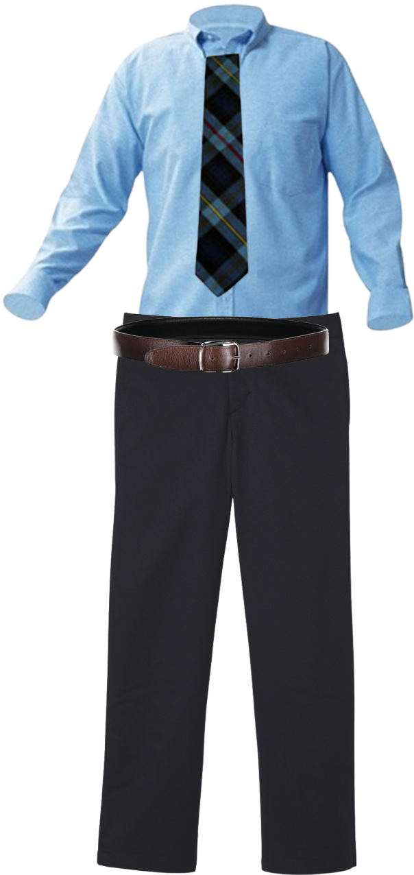
Permitted until June 2025