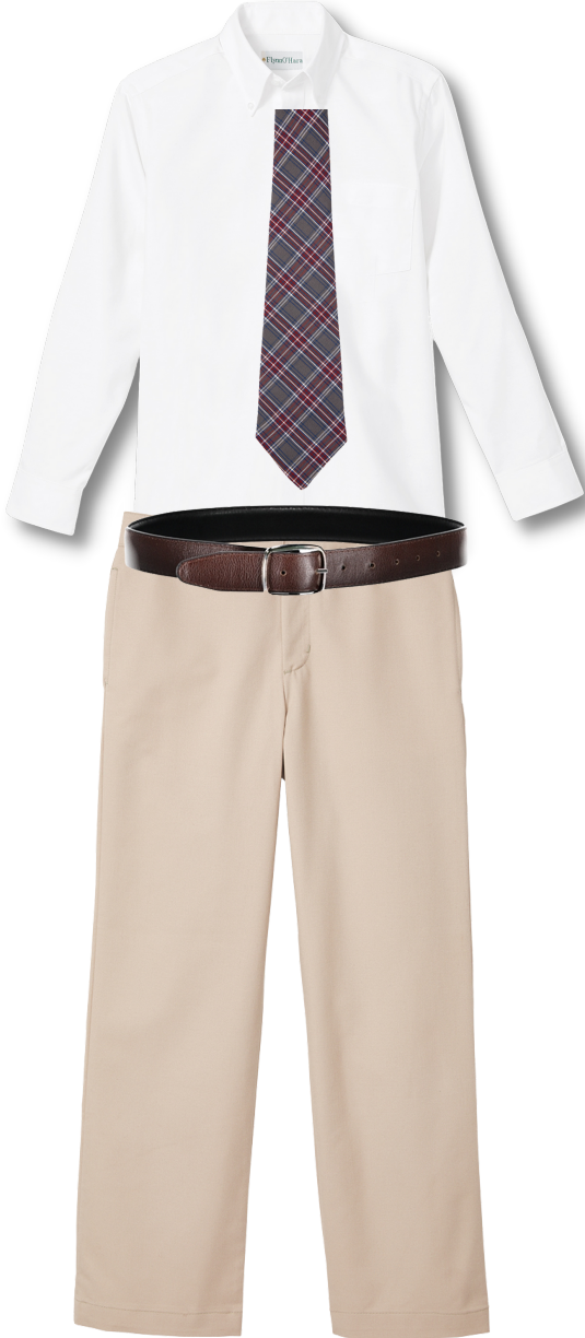
Required after June 2025