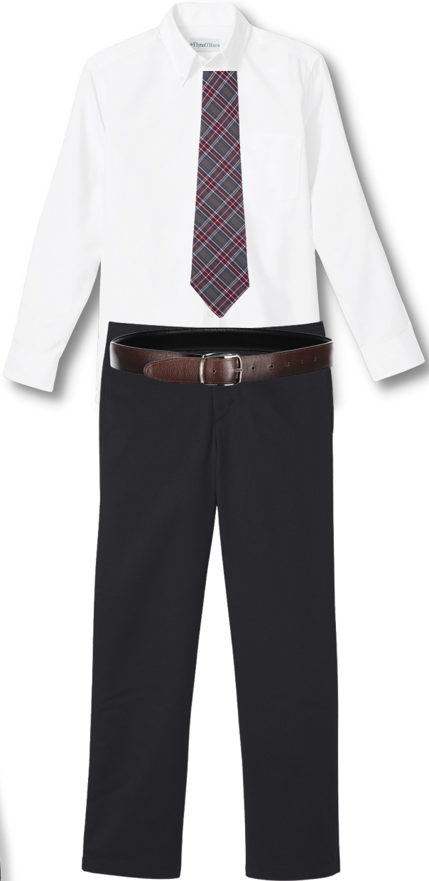
Required after June 2025